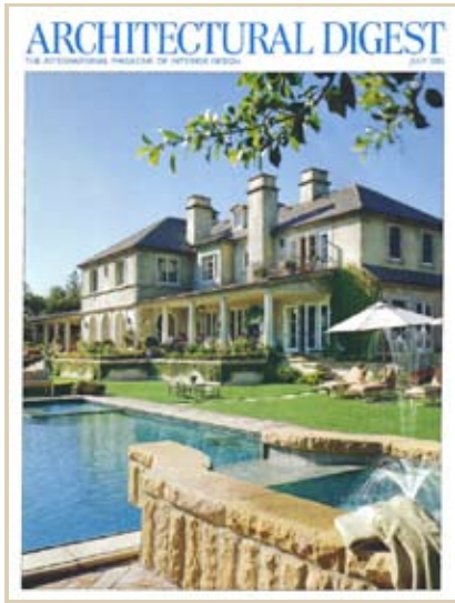
ARCHITECTURAL DIGEST July 2001 The West Wing Star at Home