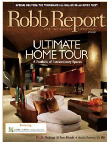
ROBB REPORT April 2007 Ultimate Home Tour