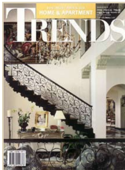
TRENDS Volume 24 No 19 Splendor Reborn