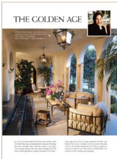
FLORIDA DESIGN MAGAZINE Fall 2007 The Golden Age